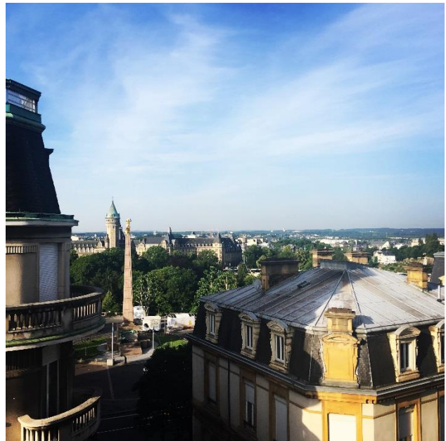
A view across Luxembourg City during our SuNSE Steering Group Meeting, June 2019.

For further information, please contact ftheate@ecotransfaire.eu