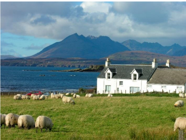
Isle of Skye, with a view to the Cuillin mountains.

The Highlands and Islands is a region home to a vibrant social enterprise sector. However, it is also a region of sparsely populated areas and remote communities, which presents a range of social and economic issues.