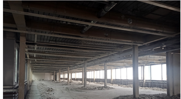
The metallic structure, revealed after the strip-out of the building. After sandblasting of fire-resistant flocking, it will be deconstructed by De Meuter, and sent to a smelter for high-value recycling.

crease implementation of digital tools in the deconstruction sector”, adds Eléonore de Roissart from Buildwise. With the Interreg project Digital Deconstruction they aim to do just that.