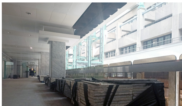
Large quantities of marble slabs were carefully dismantled and packaged by reuse operators.