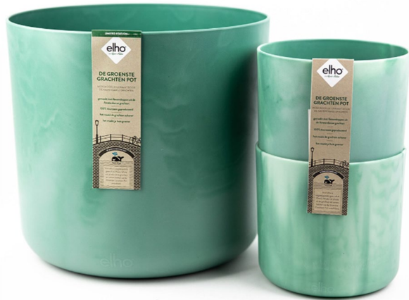
Fig. 1 Better Future Factory advertises that it has created plant pots made from plastics collected from the canals of Amsterdam (“De Groenste Grachten Pot”) for their client Elho. https://betterfuturefactory.com/portfolio_page/elho-sustainable-flower-pots/