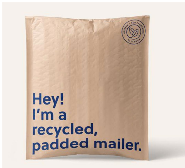
Fig. 5 Noissue padded mailers made from recycled plastic with the verbal statement “Hey! I’m a recycled, padded mailer.” on the product. https://noissue.co/marktplace/recycled-padded-mailer/

A limitation of this self-signalling guideline is that it requires the target group of the product to be environmental concerned and eager to further reduce their environmental impact via more sustainable behaviours. If the target group is less likely to appreciate environmental values, this strategy may be risky as consumers may approach these products with scepticism and may easily associate them with greenwashing [50], ultimately leading to rejection of products made from recycled plastics. Furthermore, it is important to realize that products used in public generally have better self-signalling qualities than privately consumed products [68].