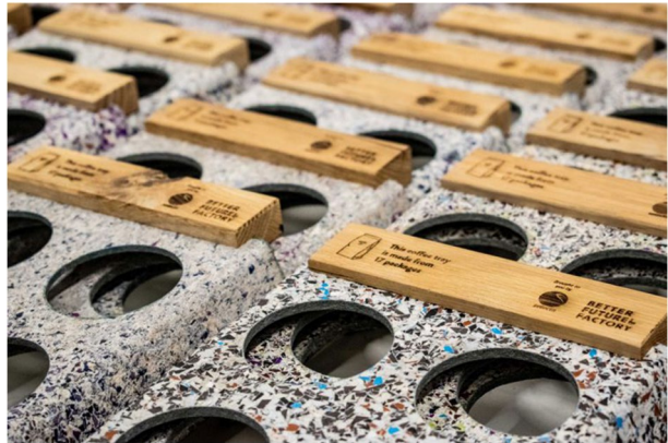
Fig. 2 Coffee trays made from recycled coffee packages by Better Future Factory. https://betterfuturefactory.com/portfolio_page/selecta-coffee-trays/