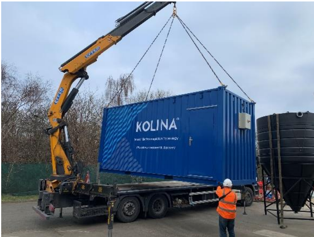
Wastewater treatment unit arriving on site in Bo'ness