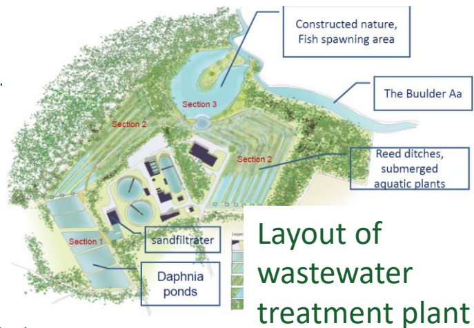
Layout of wastewater treatment plant