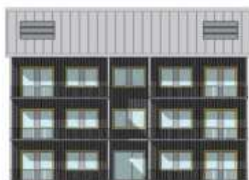
Front elevation to Edward Street

Accord will apply a closed panel timber frame construction, allowing for easy assembly, disassembly and re-assembly and re-use of components and thus relocation in case housing demands drops, whilst avoiding the use of heavy weight concrete and traditional construction methods that do not lend itself easily for prevention of downcycling. Accord Housing Association will minimize the use of plastic during the construction process. This means the organisation will use alternatives when it comes to fitting the kitchens, bathrooms and windows, as well as reducing the amount of plastic used in building materials.