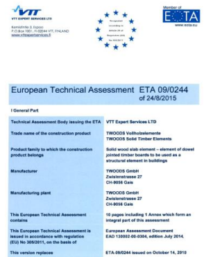
Example of an ETA

This document is issued by a Technical Assessment Body (TAB) , at the request of a manufacturer and is based on a European Assessment Document (EAD) .