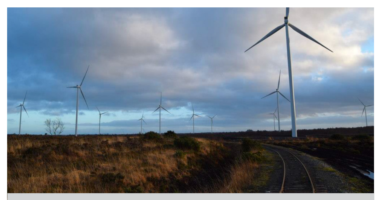
Figure 2: Mount Lucas Wind Farm Co. Offaly<sup>24</sup>

For mitigation of climate change and restoration of former over-exploited industrial cutaway peatlands, the Irish government agreed to fund a €108M project for Bórd na Móna, a former peat cutting energy provider. The project aims to restore 33,000ha of cutaway peatland that has been degraded by the company activities. This 4-year programme (2021-2025) is partly funded by the company, up to €18M and will create an opportunity for 310 jobs. The investment is followed by another €1.6 billion for renewable sources of energy with the objective of supplying one third of all Irish homes in 2030.<sup>20</sup> This objective is very ambitious as in 2020 renewable energy represented only 13.3% of the national energy mix.<sup>21</sup> The company has made a dramatic shift, driven by the lack of sustainability of their former activities (peat cutting), the global climate change mitigation effort and a very profitable conversion opportunity. This programme will reportedly help to enhance the lost biodiversity of the bogs, allow the sequestration of 3.2M tonnes of greenhouse gases and protect the existing and already vanishing carbon store (109M tonnes).<sup>22</sup> With 14 projects of renewable energy sources, as they need to offset their decreasing peat cutting activity which is likely to be reduced to zero by the year 2030.<sup>23</sup>