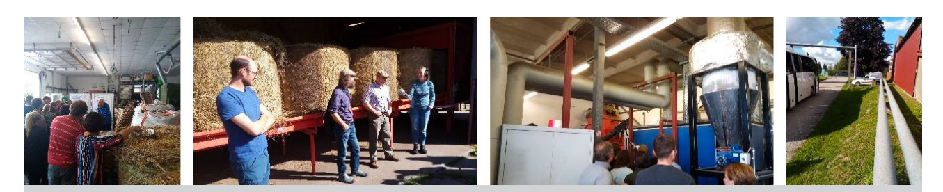
Figure 6: Biomass for district heating schemes

District heating schemes utilizing biomass from paludiculture involve the use of wetland biomass, as a renewable energy source for heating purposes in a local district or community.