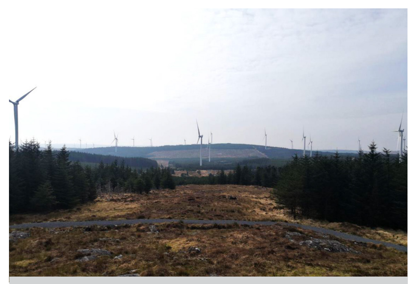
Figure 4: Galway Wind Park Co. Galway

The first ever Irish windfarm built on cutaway peatland in the Midlands was completed in 2014 in Mount Lucas, Co. Offaly. This windfarm represents an 84MW electricity power production, providing electricity for 45,000 homes.<sup>25</sup> According the "Cutaway Bog Decommissioning and Rehabilitation Plan 2021",<sup>26</sup> peat industrial extraction stopped on site in 2019 and all peat extraction stopped in 2020.