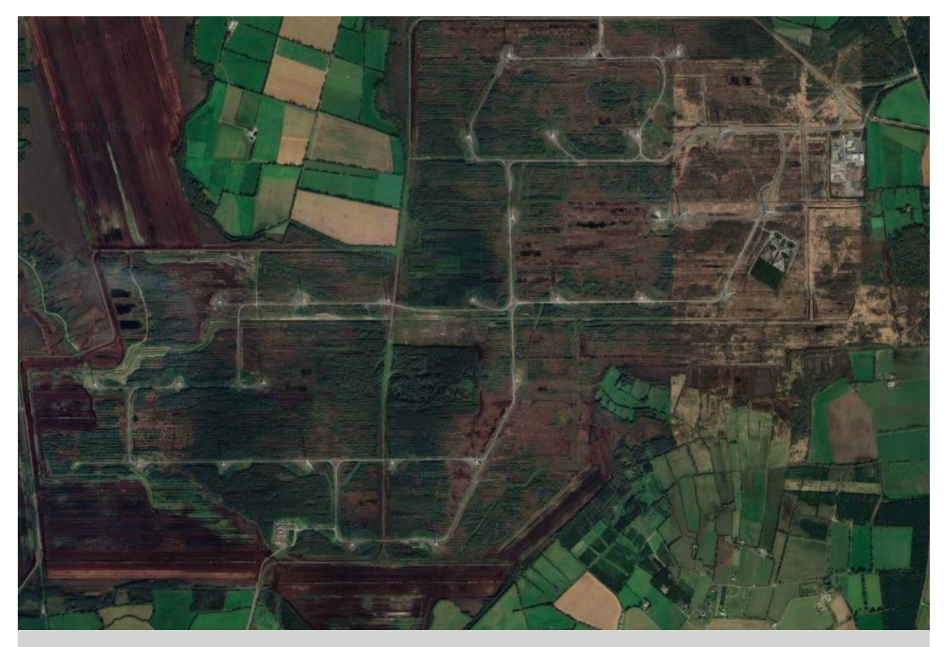
Figure 3: Mount Lucas Wind Farm Co. Offaly

The Galway wind park (Figure 4) is a good example of the complexity that can occur in dealing with sensitive environmental conditions during the installation of a wind park. Indeed, this 174MW infrastructure is located in an afforested peatland. Composed of 58 turbines of each 3MW, it is the largest wind farm on the island of Ireland. Fully in operation from 2017, the installation of the wind farm was made possible due to the already degraded state of the peatland. The monoculture of coniferous plants completely dried out the peat soil causing it to decompose. The EU Life "MULTI-PEAT" project aims to restore some of this peatland by removing the trees and rewetting dried out areas restoring part of the wintering habitat for flocks of white fronted geese. This will make it possible to combine energy generation, an improvement in biodiversity and carbon sequestration.